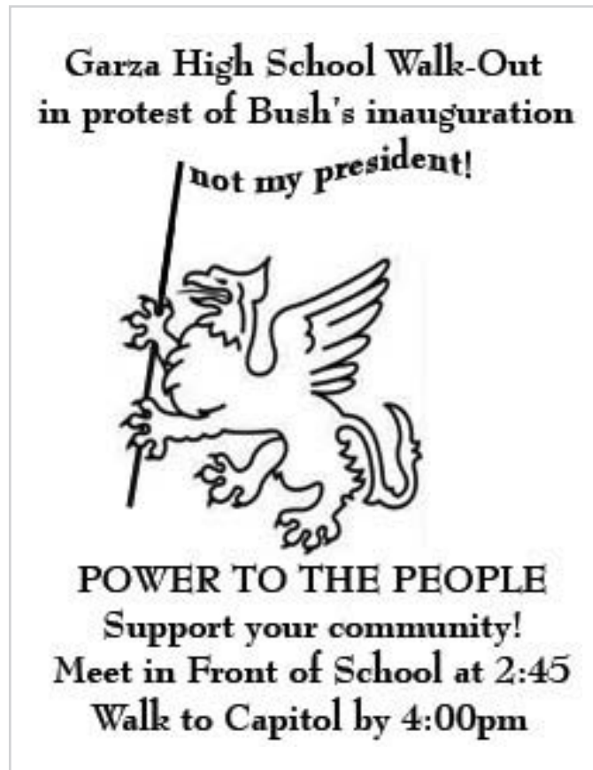
Flyer for student-organized protest, Austin, TX, 2005